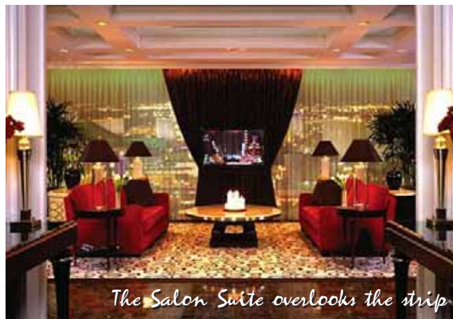
The Salon Suite overlooks the strip

The guest rooms are available in different sizes and arrangements. Pillowtop beds, flat screen TVs, bathroom with soaking tub and his & her sinks, cushy seating areas and some panoramic views will make you feel like you're in a luxurious, and very comfortable apartment. The Salon Suite