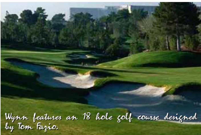
Wynn features an 18 hole golf course designed by Tom Fazio.

A big attraction to the resort will be the 18 course golf course designed by Tom Fazio right on property. The par 70 course has a complete clubhouse with professional golf assistance. A spectacular 37-foot waterfall is the focal point of the 18th hole. The resort also has a 3 acre lake with water falls — one 70 feet