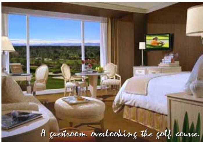
A guestroom overlooking the golf course.