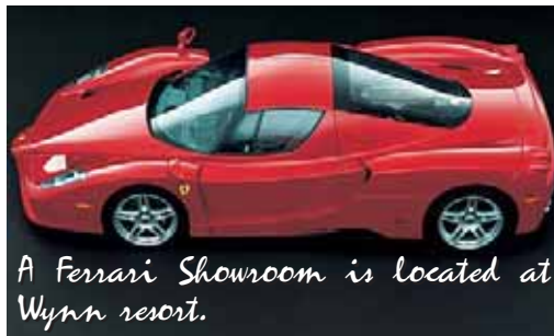
A Ferrari Showroom is located at Wynn resort.

Wynn's personal Enzo Ferrari, valued at over $1 million (with less than 100 miles on it.) As of this writing, the inventory includes 12 new and 40 pre-owned cars. For those of us in a lower tax bracket (way lower) there is a Ferrari store with logo clothing, collectibles and memorabilia.