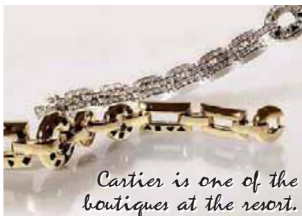
Cartier is one of the boutiques at the resort.

With the Wynn name attached, one could only expect high-end shopping, and the resort offers international, exclusive and unique boutiques with quality names such as Cartier, Chanel, Dior, Louis Vuitton, Manolo Blahnik, Oscar de la Renta, and more. Confident that Wynn Resort will bring in the moneyed folks, Roger Penske and Steve Wynn have built Nevada's only factory-authorized Ferrari / Maserati dealership right on