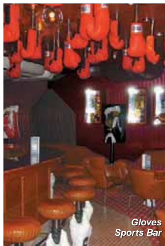
Gloves Sports Bar

I started my Harry's dining experience with an appetizer of a delicious Trio of Escargots, baked in brioche, and wrapped in rice paper and