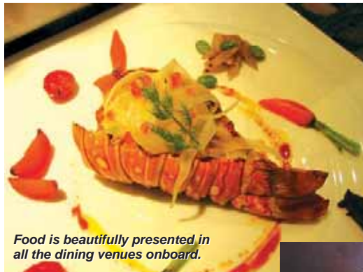
Food is beautifully presented in all the dining venues onboard.

All of Carnival’s ships have a theme that is carried out — sometimes overtly, sometimes subtly — throughout the ship. The Liberty’s is mostly art nouveau with