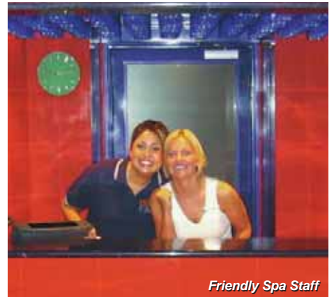
Friendly Spa Staff

elective reservations-only fine dining experience at Harry's Supper Club on the Liberty for a fee of $30 per person — which includes all your courses and tip. You may feel you have already paid for your cruise food, so why bother with this restaurant? Because you will have a