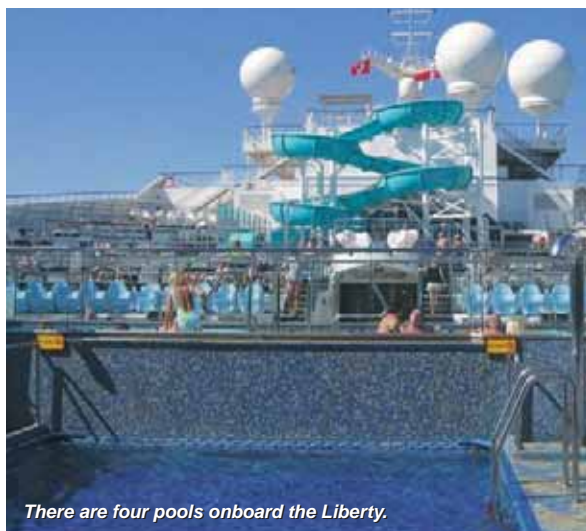
There are four pools onboard the Liberty.

vacationers. Once you go — you're hooked! Some people avoid cruising because they are afraid they will become seasick, which is a legitimate fear.