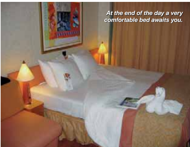
At the end of the day a very comfortable bed awaits you.

some definite Victorian touches, and then a nod to “modern” 20th-century art with impressionistic colors, and was decorated by Joe Farcus, Carnival’s favorite interior designer/architect. There are eclectic areas