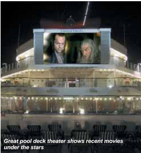
Great pool deck theater shows recent movies under the stars

also, such as the Gloves Sports bar with countless boxing gloves hanging from the ceiling, and the beautiful Empress Lounge with Asian motif.