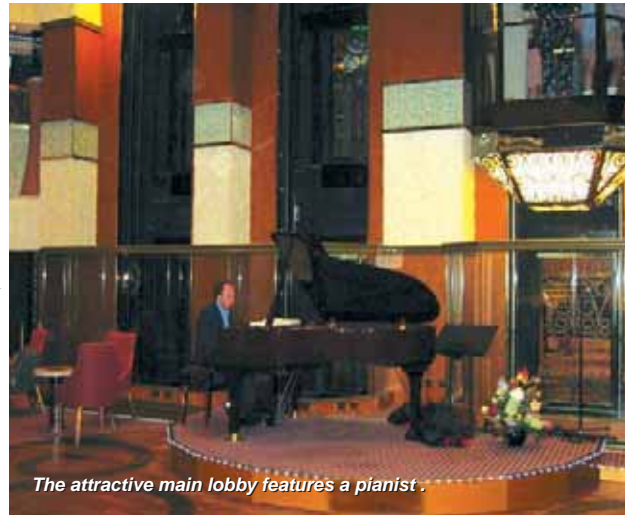
The attractive main lobby features a pianist.

Book a cabin with a balcony — you will find it is well worth it to be able to sit outside in your robe (supplied by Carnival), relax, and enjoy the sea and