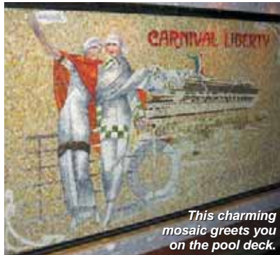
This charming mosaic greets you on the pool deck.

However, the new large cruise ships are so well stabilized, very few people have a problem, and the more sensitive ones can prepare with a pill or patch.