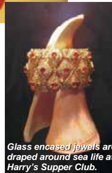
Glass encased jewels are draped around sea life at Harry’s Supper Club.

For additional information and reservations, contact any travel agent, call 1-800-CARNIVAL or visit carnival.com .