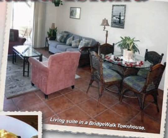
Living suite in a BridgeWalk Townhouse.

BridgeWalk plays host to the Anna Maria Artist Guild, which is very www.AccentOnTampaBay.com