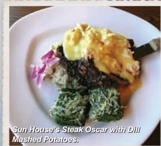
Sun House's Steak Oscar with Dill Mashed Potatoes.

strong in the area. Artists come and do some working displays at the resort, as well as feature their paintings. A scheduled dinner with the artists leads to animated discussions about art, and the events are growing in popularity.