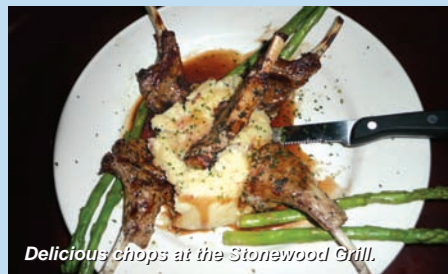
Delicious chops at the Stonewood Grill.

The Stonewood Grill & Tavern is an area favorite, and is packed most of the time. Although there are 16 Stonewood Grills in